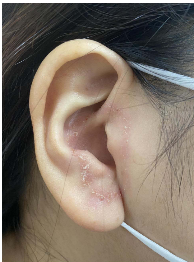
Figure 1 Annular erythema on the right ear.