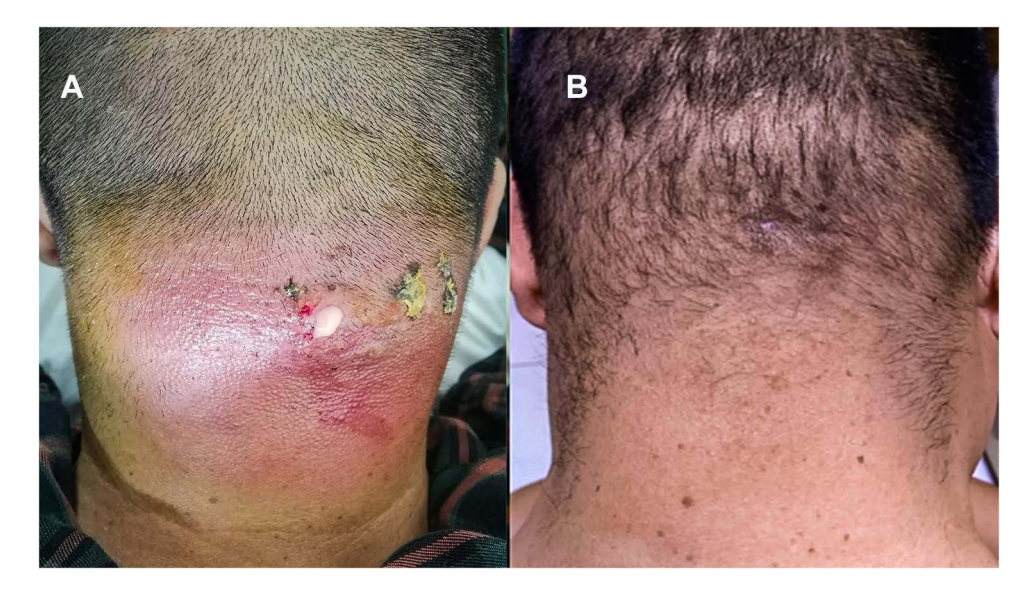
Figure 2 Patient 2: (A) lesion before fire needle treatment. (B) lesion after 21 days of fire needle treatment.

The treatment plan was as follows: intravenous ceftriaxone 2g one time a day was administered for 7 days duration. In light of poor glycemic control, subcutaneous insulin (0.5–0.8 U/kg) was initiated. The wound was managed conservatively with fire needle therapy and cupping therapy, combined with pus drainage and copious irrigation with hydrogen peroxide, saline, and gentamicin solution once a day for 5 days. The pain and body temperature were significantly reduced after the first treatment, and the swelling was reduced. The patient could lift his head. The irrigation with hydrogen peroxide, saline, and gentamicin solution through the pinhole of the fire needle was followed up every two days. The wound had completely healed after 3 weeks and without any scar (Figure 2B). One year later, the patient came because of head folliculitis to undertake fire needle therapy, which revealed that the carbuncle did not recur again.