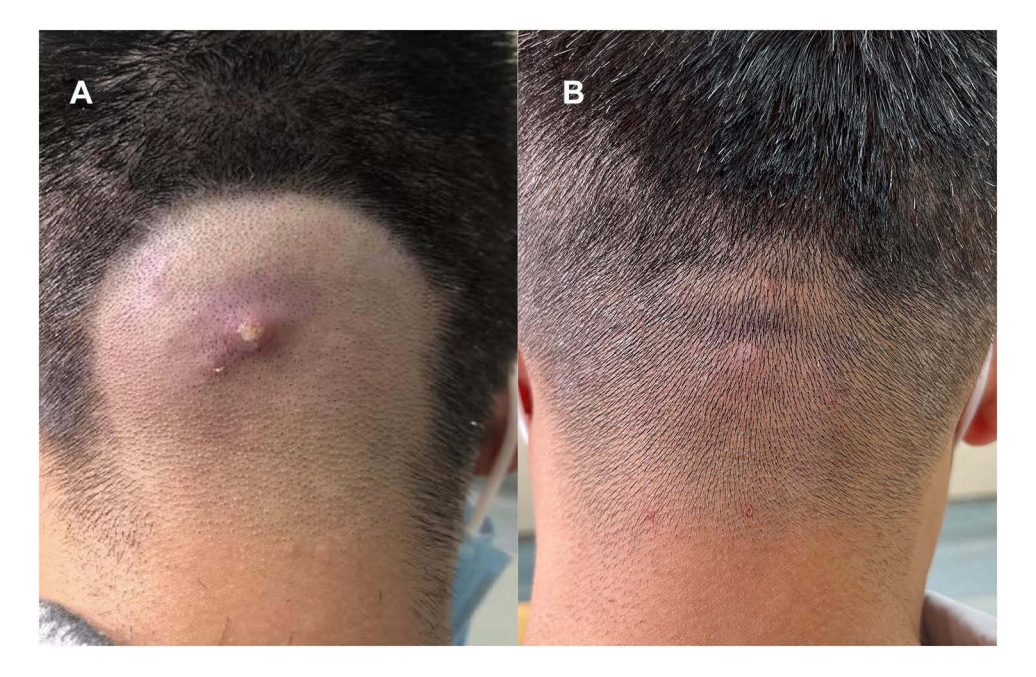
Figure 4 Patient 4: (A) lesion before fire needle treatment. (B) lesion after 14 days of fire needle treatment.

The treatment plan was as follows: on the day of treatment in outpatient intravenous infusion of ceftriaxone sodium 1.0 g, then changed to oral cefradine capsules 0.5 g three times a day for 7 days duration. Due to the patient 's unbearable pain, oral paracetamol tramadol tablets 1 tablet one time a day for 1 day of treatment. Conservative treatment of wounds with fire needle therapy, combined with cupping therapy to attract purulent secretions. With a large number of hydrogen peroxide, saline and gentamicin solution to the wound washed once a day. He applied local wet compress of compound Huangbai liquid and mupirocin ointment to the wound after returning home. Case 4 was treated every other day for a total of two courses. After the first treatment, the swelling was reduced. The patient 's pain was significantly reduced, and the sleep was basically not affected. After the second treatment, the patient 's swelling basically subsided. The wound healed completely after 2 weeks without any scar left (Figure 4B).