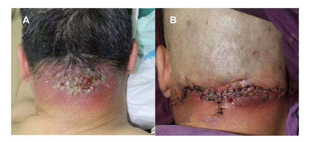
Figure 3 Patient 3: (A) lesion on admission. (B) lesion after surgical debridement and drainage.