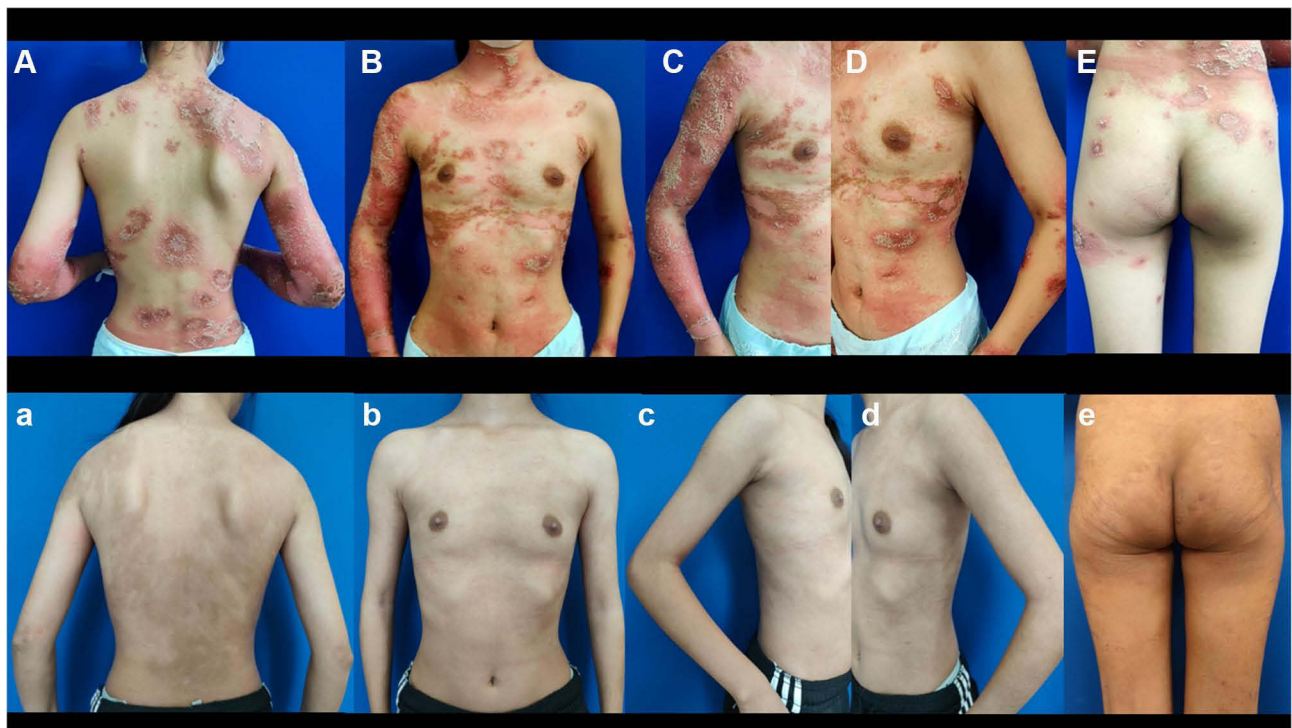
Figure 2 Manifestations on the trunk and limbs of the patient before treatment with narrowband ultraviolet B and acitretin ( A–E ) and after treatment with narrowband ultraviolet B and acitretin ( a–e ).