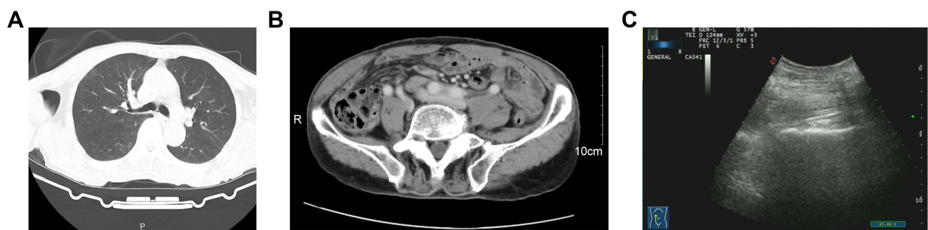
Figure 3 Images of this case after a completed treatment. (A) CT images of lung; (B) CT images of abdomen; (C), ultrasonic images of the right psoas muscle.

Based on the drug sensitivity results of the blood culture, the treatment was switched to ceftriaxone (2 g, intravenous injection) plus levofloxacin (0.5 g, oral administration) once daily. During this period, methylprednisolone sodium succinate was injected to modulate inflammation and improve oxygenation. After the comprehensive treatments, re-examination revealed a gradual decline in blood inflammatory markers and cleared bacteria (negative blood culture). The patient was discharged after 3 weeks of hospitalization and continued with cefixime (0.1 g twice per day) plus levofloxacin (0.5 g once per day) orally administered for 9 days. The entire treatment period was 30 days. Eventually, the blood inflammatory markers of the patient returned to normal, and the lung images showed that lung lesions (Figure 3A) had disappeared and abdominal images revealed the obvious absorption in the psoas abscess (Figure 3B and C).