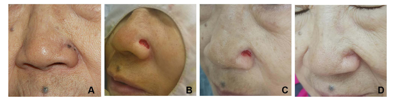
Figure I Defects involving lateral ala healed by secondary intention of a 77-year-old female trichoblastoma patient, with excellent outcome: (A) before surgery; (B) immediately after surgery; (C) 3 days after surgery and (D) 3 weeks after surgery.