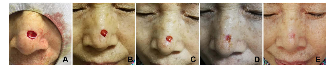
Figure 2 Defects involving anterior tip healed by secondary intention of a 62-year-old female basal cell carcinoma patient, with good outcome: (A) immediately after surgery; (B) 3 days after surgery; (C) I week after surgery and (D) 2 weeks after surgery and (E) I month after surgery.