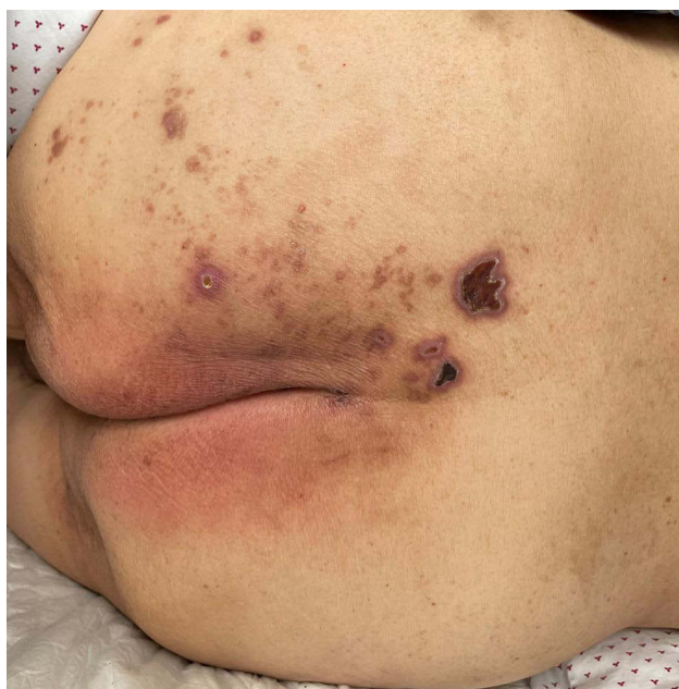
Figure 1 Classic shingles appearance in the S2–S4 distribution of the buttock.