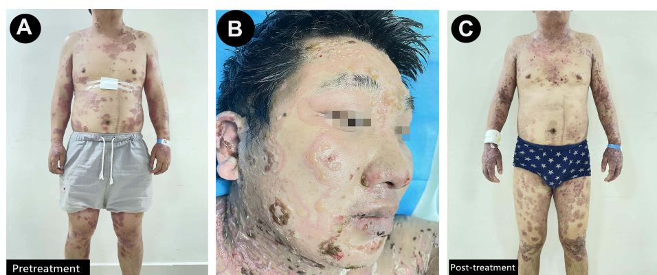
Figure 1 (A) Scattered erythema on trunk and extremities with thick-walled blisters on the erythema. (B) Edema and erythema is seen on the face and neck with blisters at the edge of the erythema, resembling a wreath. (C) Scattered erythema, scabs, scars, and hyperpigmentation seen on trunk and extremities.