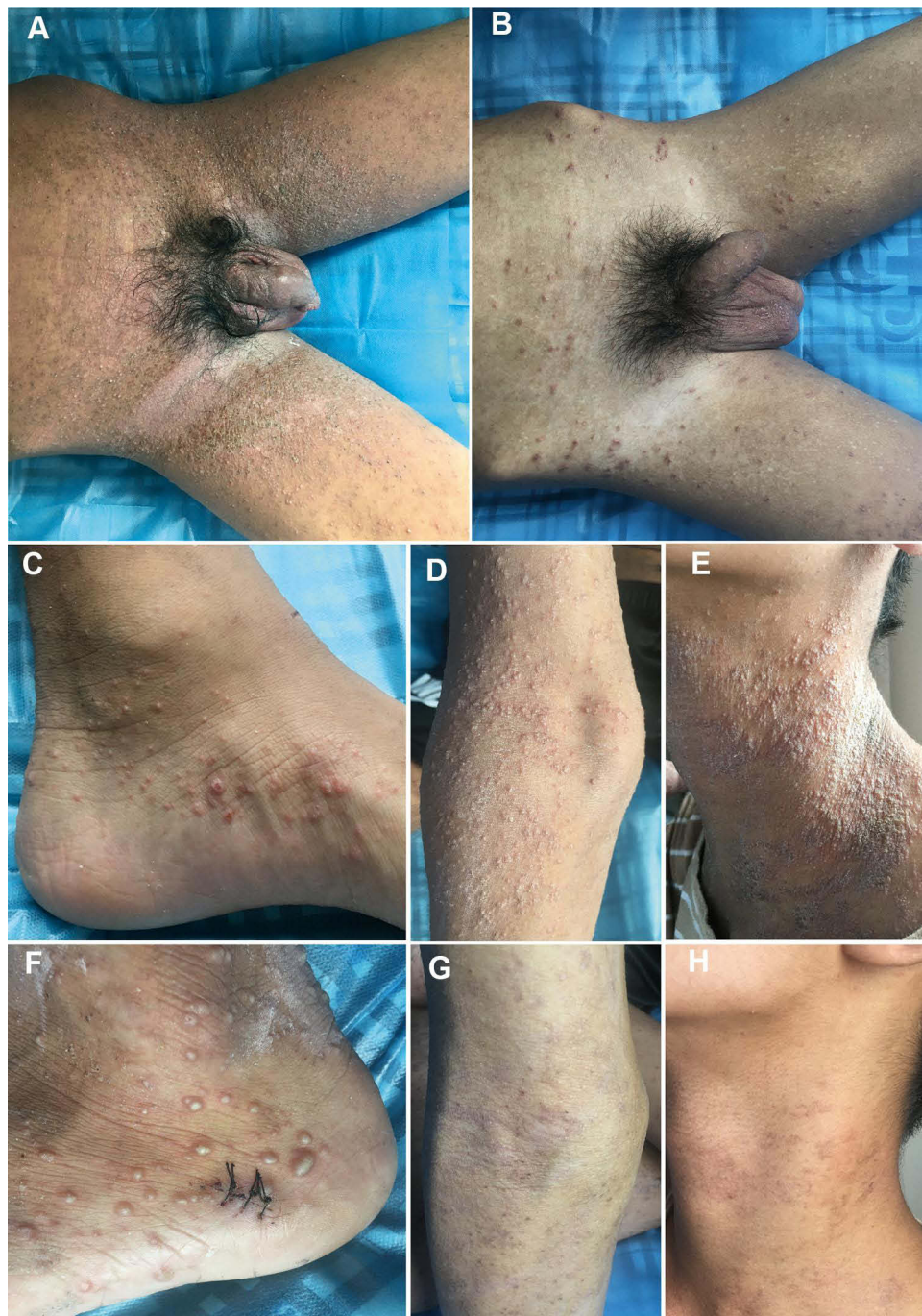
Figure 1 Clinical features of the patient. (A) At the admission time, the inguinal and scrotal scabs were accompanied by severe exudation. (B) After 6 days of treatment, the skin lesions basically subsided. (C-F) Red papules began to appear on both feet, and blisters gradually spread all over the body, except the head, face, and soles of the feet. (G, H) The patient was discharged with improved skin lesions, remaining milium and post-inflammatory hyperpigmentation.

The clinicopathological abnormalities of the 14-year-old boy include generalized red papules, papulo vesicles and blisters ranging from millet rice to soybean size. Skin lesions change rapidly, and scabs can be accompanied by exudation. Pathological skin biopsy revealed acantholysis, and the presence of blisters on the basal cells and under the stratum corneum can be simultaneously observed on a same pathological section. Type IV collagen immunohistochemistry suggested intra-epidermal blisters. In the first pathological biopsy, both Darier-like, Pemphigus Vulgaris-like, and Hailey Hailey-like patterns were observed. Although histologically similar, Hailey-Hailey disease and Darier's disease were excluded in this case due to the absence of a history of Darier and Hailey-Hailey disease, absence of keratinoid verruca in the seborrheic area, hair follicle involvement, or