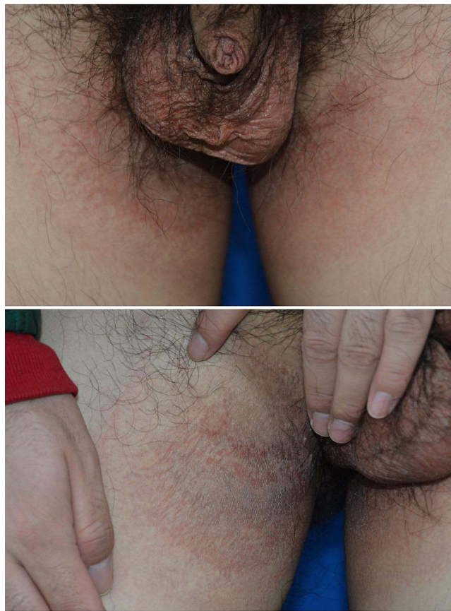
Figure 1 Clinical manifestation of GP. In the groin and scrotum, red macules and patches are seen, with well-defined borders, dry surfaces, and overlying desquamation.