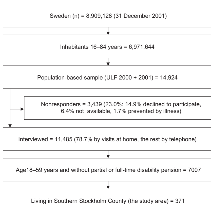
Figure 1 Flowchart of the ULF (Undersökningarna av levnadsförhållanden) surveys 2000 + 2001.

The predictive (independent) variable was the living condition. The results are presented with odds ratios (OR), 95% CI and P values.