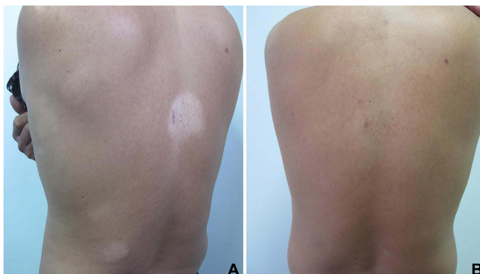
Figure 1 (A) The lesions of hMF generally presented as hypopigmented plaque or patch without obvious feelings. (B) The lesions of this patients were relieved obviously treated with topical nitrogen mustard combined with topical glucocorticoid for 1 year.