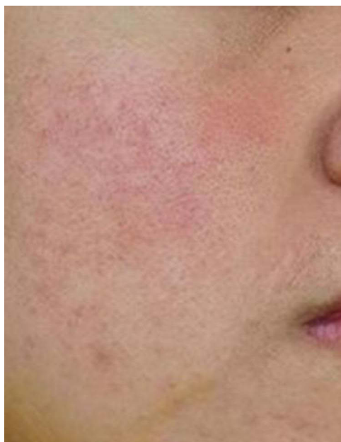
Figure 1 Dry erythematous patch, follicular scales and rough skin with “sandpaper-like” texture on the right cheek.

Demodex mites are common ectoparasites in human skin. Studies have shown that the number of mites increases with age and is found to be significantly higher in people with obesity, high blood sugar levels, end-stage chronic renal failure and immunodeficiency. 7–9 In addition, an abnormal increase in the number of Demodex mites has been reported following repeated facial application of topical steroids and other immunomodulators. 10 Changing in facial skin microenvironment, moisture, pH levels, types and quantities of skin surface lipids and epidermal barrier function may facilitate Demodex mite proliferation. 11 The Demodex mite can cause multiple skin disorders, which are grouped under the term demodicosis or demodicidosis. Some studies have shown an association between acne vulgaris and Demodex mite infestation, suggesting that when conventional treatments for acne vulgaris are ineffective, examination of Demodex mites and acaricidal therapies should be considered. 2,12 This report demonstrates a case of demodicosis presenting with clinical symptoms that looked like acne vulgaris, including erythematous edematous papules and pustules on both cheeks, leading to the difficulty in differential diagnosis. Therefore, the method used to determine the mite density per square centimeter is important for diagnosing demodicosis. Standardized skin surface biopsy