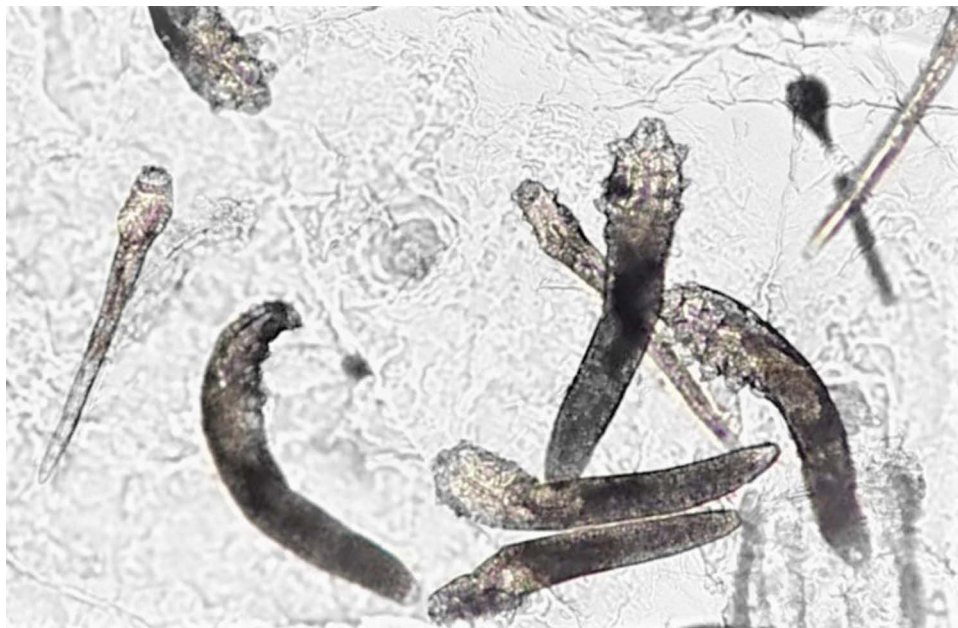
Figure 3 Multiple Demodex mites are detected by standardized skin surface biopsy from the rash on the right cheek.

(SSSB) is commonly used to determine Demodex mite density from skin of the patients. Demodicosis is diagnosed when there is a high density of Demodex mites ( >5 Demodex mites/cm 2 ). 13 A method for assessing Demodex mite density in papulopustular lesions, called “superficial needle-scraping” (SNS), is performed by scraping off 5 small pustules with the tip of a needle for microscopic examination. Demodex mite density was reported as “mites per 5 pustules” for SNS. Demodicosis is diagnosed when there is a high density of Demodex mites, at \geq 3 Demodex mites per 5 pustules. 14 In this patient, the results of microscopic examination revealed an abnormal increase in the number of Demodex mites from both SSSB and SNS methods and, combined with the relevant clinical presentations, led to the