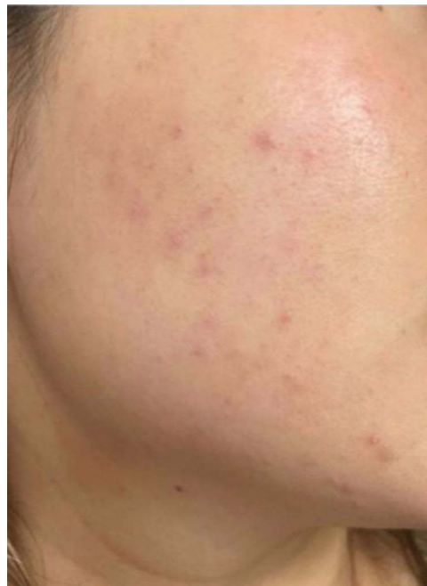
Figure 2 Dry, patchy erythema on face and upper part of the neck combined with multiple small edematous erythematous papules and minute whitish papules, size 3–5 mm, discrete on the right cheek.

(SSSB) is commonly used to determine Demodex mite density from skin of the patients. Demodicosis is diagnosed when there is a high density of Demodex mites ( >5 Demodex mites/cm 2 ). 13 A method for assessing Demodex mite density in papulopustular lesions, called “superficial needle-scraping” (SNS), is performed by scraping off 5 small pustules with the tip of a needle for microscopic examination. Demodex mite density was reported as “mites per 5 pustules” for SNS. Demodicosis is diagnosed when there is a high density of Demodex mites, at \geq 3 Demodex mites per 5 pustules. 14 In this patient, the results of microscopic examination revealed an abnormal increase in the number of Demodex mites from both SSSB and SNS methods and, combined with the relevant clinical presentations, led to the