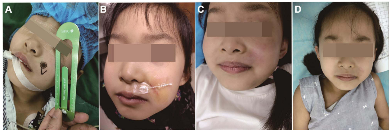
Figure 2 A 5-year-old female undergoing the excision of facial cutaneous lesions (congenital melanocytic nevus, CMN). (A) before the excision of facial cutaneous lesions; (B) 7 days after the excision of facial cutaneous lesions; (C) 2 months after the excision of facial cutaneous lesions; (D) 6 months after the excision of facial cutaneous lesions.

through the tensioner gap, CO 2 -AFL surgery is performed. Following every CO 2 -AFL surgery, wound gel (B. Braun Medical Inc, Bethlehem, PA) was applied for the following 7 days to promote epithelization. CO 2 -AFL was performed upon suture removal, at one month, 3 months, and 5 months later.