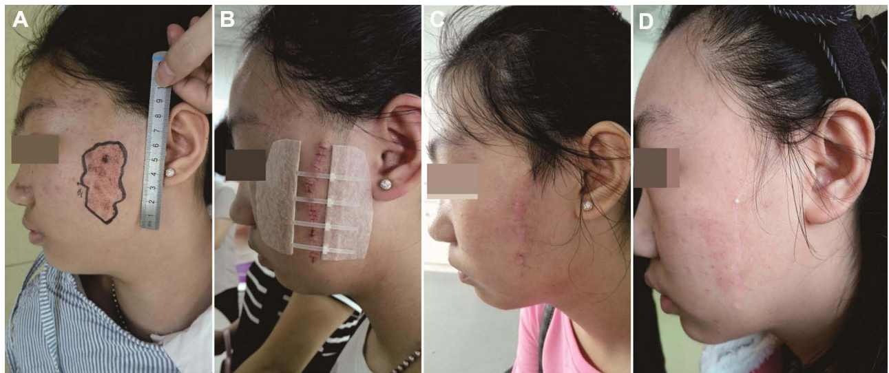
Figure 1 A 12-year-old female undergoing the excision of facial cutaneous lesions (sebaceous nevus, SN). (A) Before the excision of facial cutaneous lesions; (B) 7 days after the excision of facial cutaneous lesions; (C) 2 months after the excision of facial cutaneous lesions; (D) 6 months after the excision of facial cutaneous lesions.