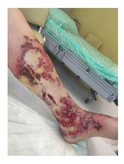
Figure 4 Image of the lower limb after returning from treatment in the hyperbaric chamber.