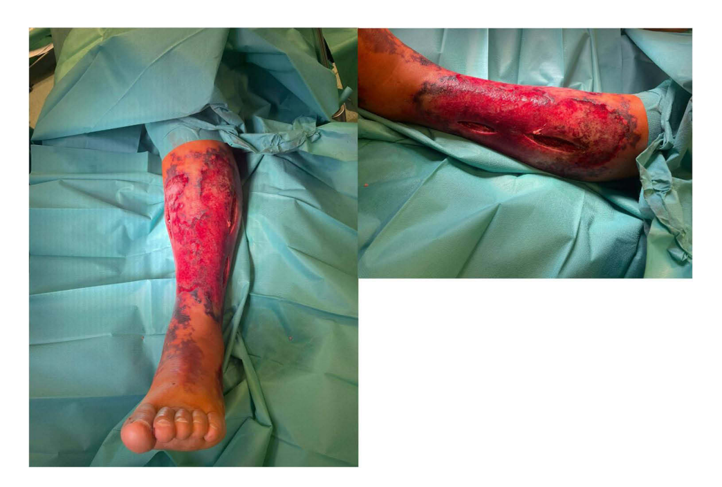
\textbf{Figure 3} \ \text{Image of the lower limb during surgery}.

The patient underwent hyperbaric oxygen therapy (HBOT) sessions twice a day in the multiplace hyperbaric chamber, dressings of the lower limb were changed daily, and antibiotic therapy, symptomatic treatment, and pain relief were administered. During this stay, a single increase in body temperature to 37.8°C was observed without general symptoms. At the local center, the patient was treated