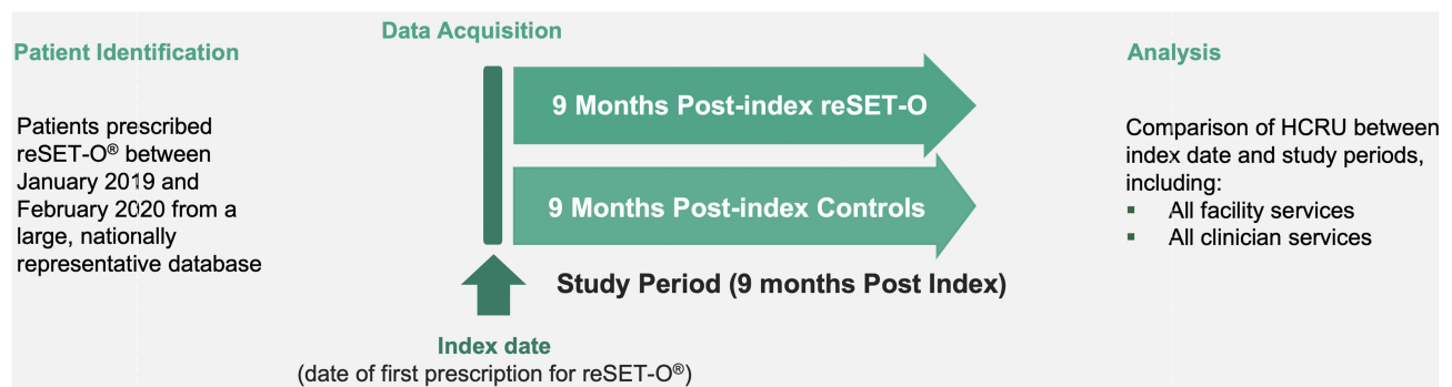
Figure 2 Study design.