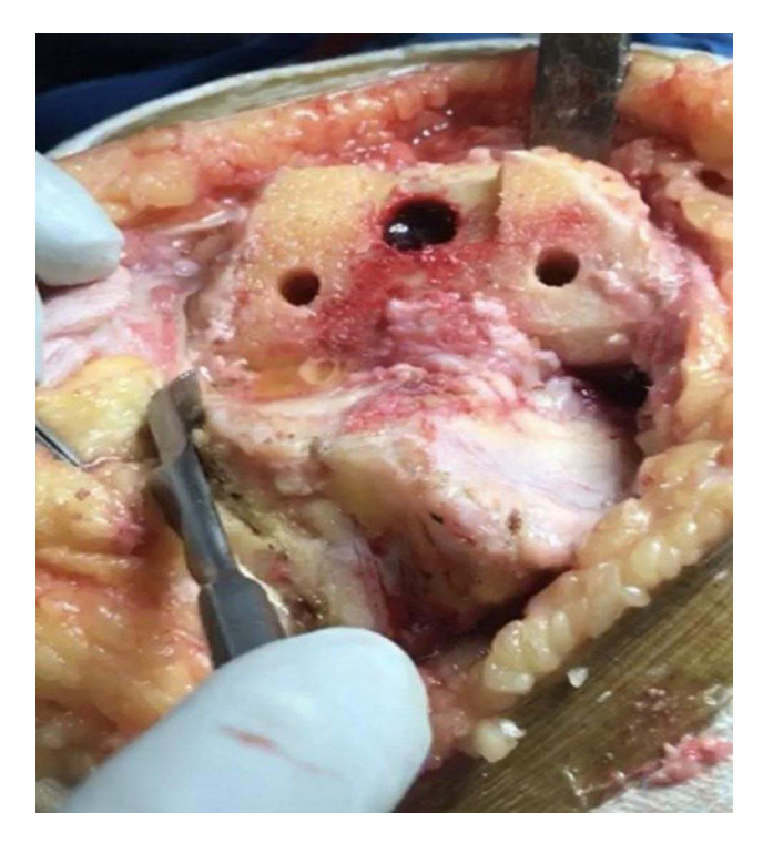
Figure 2 Intra-operative image showing release of posterolateral corner.

This posterolateral release differs from a similar release done for the valgus knee in that the iliotibial band, lateral retinaculum and the lateral collateral ligament are left untouched. In our study, posterolateral release was