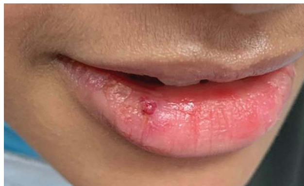
Figure 3 After one week of topical salt use, the lesion was markedly reduced in size and became a small papule.