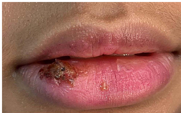
Figure 2 5 days after suture removal of the partially excised lesion when a two cycles of cryotherapy was done.

Following suture removal 5 days later, further treatment was required to address incomplete lesion excision (Figure 2). Two cycles of cryotherapy were performed but were not tolerated by the patient. Thus, the patient's mother was advised to administer a treatment at home that involved 1) applying table salt to the lesion, 2) coating the perilesional skin with Vaseline, and 3) covering the wound with a gauze. One week later, the lesion was markedly reduced in size and consisted of a small papule (Figure 3). To reduce irritation of the lesion caused by direct salt application, home treatment was continued with cotton buds soaked in salt water that were applied to the lesion one to two times per day. After 2 weeks of salt treatment, the patient's lesion had completely resolved (Figure 4).