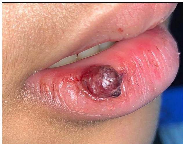
Figure 1 Lesion at presentation as erythematous friable papule, measuring 1 cm in diameter, on the right half of the lower lip.

Following suture removal 5 days later, further treatment was required to address incomplete lesion excision (Figure 2). Two cycles of cryotherapy were performed but were not tolerated by the patient. Thus, the patient's mother was advised to administer a treatment at home that involved 1) applying table salt to the lesion, 2) coating the perilesional skin with Vaseline, and 3) covering the wound with a gauze. One week later, the lesion was markedly reduced in size and consisted of a small papule (Figure 3). To reduce irritation of the lesion caused by direct salt application, home treatment was continued with cotton buds soaked in salt water that were applied to the lesion one to two times per day. After 2 weeks of salt treatment, the patient's lesion had completely resolved (Figure 4).