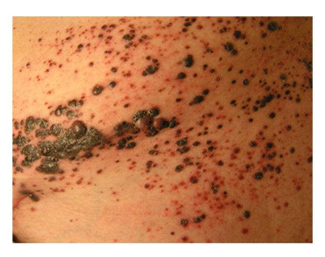
\textbf{Figure I} \ \ \textbf{Unresectable melanoma in-transit metastases}.

Localized administration of immune modulating agents has been shown to lead to regression of cutaneous melanoma metastases in several phase II studies. In one study, intralesional interleukin-2 given 2–3 times weekly was tested in 24 patients with one or more soft tissue or cutaneous melanoma metastases yielding complete responses in 65%