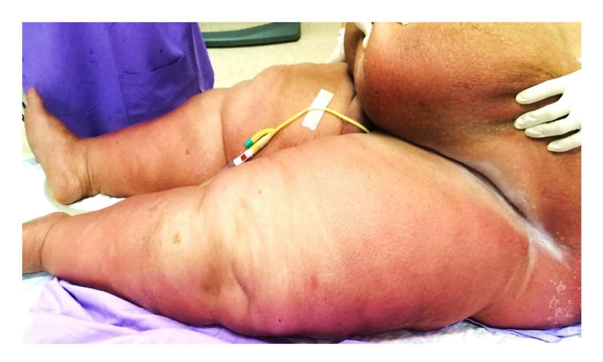
Figure 1 Acute inflammatory edema manifesting as erythematous, edematous plaques on the lower abdomen and dependent parts of the lower extremities with sparing of the skin folds

Based on her clinical presentation and investigation findings, a diagnosis of AIE was made. We ensured fluid restriction and administered diuretics and adjuvant hemodialysis. No antibiotics were administered. Ten days following this treatment regimen, the cutaneous lesions showed marked response, and her condition was greatly improved.