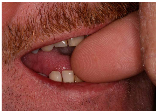
Figure 2 Cause of trauma on that area in the patient was actually a harmful habit of nail-biting. Note position of thumb nail on distal incisal edge of central incisor and pressure applied on mesial edge of lateral incisor.

Teeth with greater mobility present less favorable changes after periodontal treatment than firmer teeth. 122 Occlusal adjustment has also been shown to reduce tooth mobility. 123 Furthermore, periodontal treatment in conjunction with occlusal adjustment tends to result in a slightly more favorable attachment level gain than treatment without occlusal adjustment. 124 Therefore, occlusal therapy needs to be