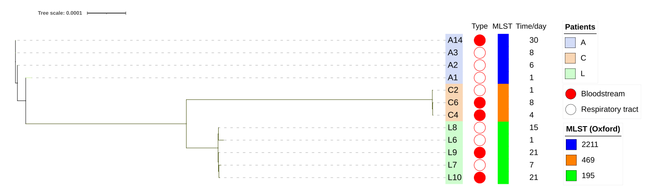
Figure I Phylogenetic analysis of A. baumannii collected from respiratory tract carriage to bloodstream infection in three patients. The phylogenetic tree was constructed based on core single nucleotide variants. The scale bar represented the number of nucleotide substitutions per sites. The colour of the outer of the trees denoted different patient. The red circle denoted isolates from bloodstream and the white circle denoted isolates from respiratory tract. The sampling time interval was listed on the right, and the first isolate in each patient was set day I.

(Table S2). A complete list of all the genic mutations differing between the isolates was given in Table 1. Except for a hypothetical protein, the SNVs were found in srpA, gspJ, srmB, fimV, sca1, transposase, pilR, pcaJ, tniA genes, which encode for organic peroxide-dependent peroxidase, general secretion pathway protein, DEAD box helicase family, Tfp pilus assembly protein FimV, phagerelated minor tail protein, transposase IS66 family, sigma-54 interaction domain protein, 3-oxoadipate CoA-transferase, and mu transposase, respectively. Two genes encode the same protein, Tfp pilus assembly protein FimV. The genes encoding for 3-oxoadipate CoA-transferase PcaJ and Tfp pilus assembly protein FimV had the highest density of SNVs. Two missense variants (Ile91Leu, Phe90Leu) and one synonymous variant (Arg89Arg) were detected in PcaJ. One missense variant (Thr4Lys) and two synonymous variants (Asp5Asp and Asp18Asp) were detected in FimV.