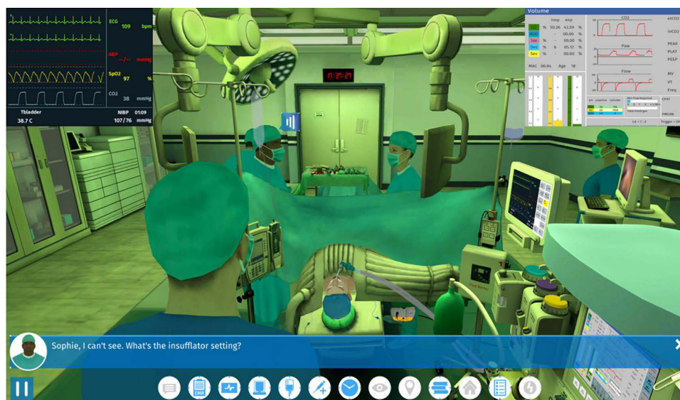
Figure 1 Screen-based simulation screen appearance. Real time dynamic graphics are used to depict operating room events. Dialogue options (readable and audible) allow the user's avatar to communicate in this environment. All anesthesia devices are interactive. Excerpted with permission from Anesthesia SimSTAT – Appendectomy course from the American Society of Anesthesiologists. Information related to the course can be requested from ASA, 1061 American Lane Schaumburg, IL 60173–4973 or online at www.asahq.org .

At the start of each session, the instructor introduced the technology, and thereafter manipulated the program avatar through the software scenario with scripted educational pauses to communicate learning content. Because the SBS software scenario was run in real time, use of a “pause” option was essential to allow for such instructor-led teaching opportunities. A small portion of the scripted instructor session for this scenario with a pause to teach important anesthesia considerations is shown in Figure 2. Examples of these considerations included best practice diagnostic algorithms and interventions for increasing hypercarbia, increased intra-abdominal pressures, and elevated airway pressures during laparoscopic surgery.