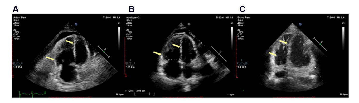
Figure 2 Transthoracic echocardiography. The four cavity heart section views are shown at (A) the first admission, (B) 5 months after discharge (10 months after dasatinib withdrawal) and (C) 12 months after discharge (17 months after dasatinib withdrawal). The arrows showed that enlargement of right ventricle and atrium was gradually restored, as well as the left transposition of the septum and compression of the left ventricle.

decreased and right lung respiratory sound disappeared. No obvious dry or wet rales were heard. Cardiac auscultation revealed P2 hyperactivity and a systolic murmur on the left sternum 4–5 intercostal, grading 3/6 level. Liver could be reached, and severe pitting edema of both lower extremities