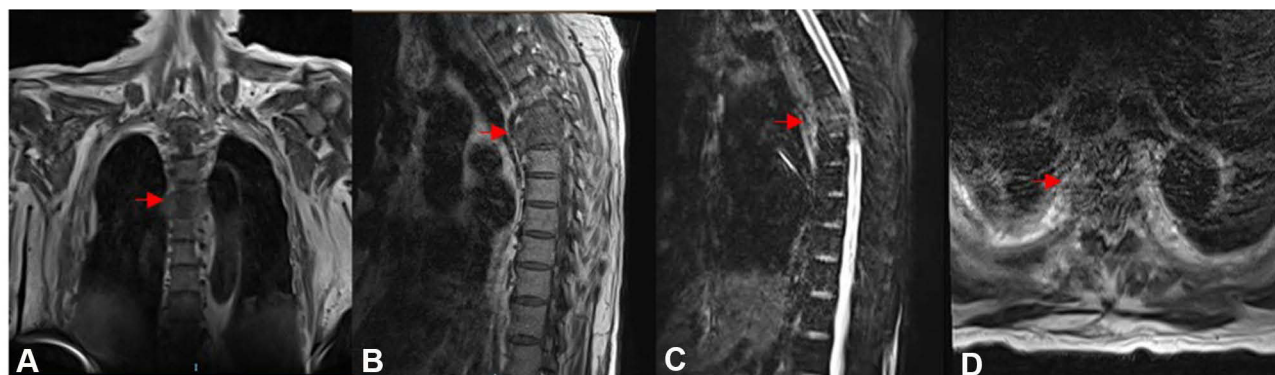
Figure 1 MRI of the thoracic spine. (A) Coronal view showed destruction of thoracic spine with pedicular involvement (arrow). (B) Sagittal view T1-weighted images showed wedging of 5th and 6th thoracic spine (arrow). (C) Sagittal view T2-weighted images showed a pathological intensity with increased signal on the 5th and 6th vertebral bodies (arrow) and extended to paravertebral region and compressed the spinal cord on that level (D).

A week after hospital admission, we performed a posterior stabilization with the pedicle screws and rods system on 4th, 5th, 7th and 8th thoracic spines and transpedicular biopsy on 6th vertebra (Figure 2). A 3 cc of purulent discharge was oozing out from the 6th thoracic body while performing the biopsy. Tissue samples for culture and pathological exam were obtained and macroscopically similar to granulation tissue from tuberculous infection. Debridement was further attempted. Decompression was achieved by laminectomy and flavectomy on the 5th and 6th thoracic level. A similar granulation tissue was found underneath the laminae and yellow ligament. Postoperatively, the patient was sent back to ICU for general health stabilization.