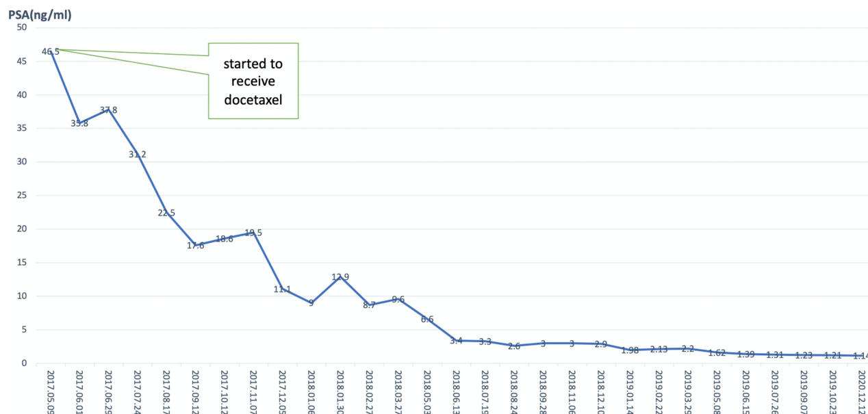
Figure 3 PSA response after receiving long-term multiple cycles docetaxel administration in patient 3. The patients received maintenance docetaxel chemotherapy for a total of 35 cycles. The PSA level of the patient was monitored regularly after docetaxel therapy. At the time of writing, the patient was still being treated with docetaxel.

docetaxel and progresses. For continuous docetaxel therapy, docetaxel is continuously infused in every cycle until the disease eventually progresses. Currently, most studies about maximizing exposure to docetaxel in prostate cancer are based on intermittent docetaxel therapy. 8,14–16