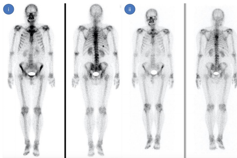
Figure 2 Bone metastases response after receiving maintenance long-term multiple cycles docetaxel chemotherapy in patient 2. After 14 cycles of docetaxel administration, bone ECT showed significant remission of bone metastasis in patient 2. (i) Baseline of docetaxel administration, (ii) after 14 cycles of docetaxel administration.