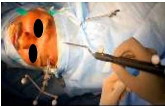
Figure 2 Intra-operative placement of localizer and a surgical probe. A pointed end of surgical probe serves a purpose of marking anatomical landmark.

carried out by a sensor probe or tracker attached to a navigation system [5,6]. Generally speaking, these points are the bony landmarks, which serve as guiding points to predict critical anatomical landmarks and also to orient the surgical plane based on these references (Figures 2 and 3). Although these reference points can vary according to the