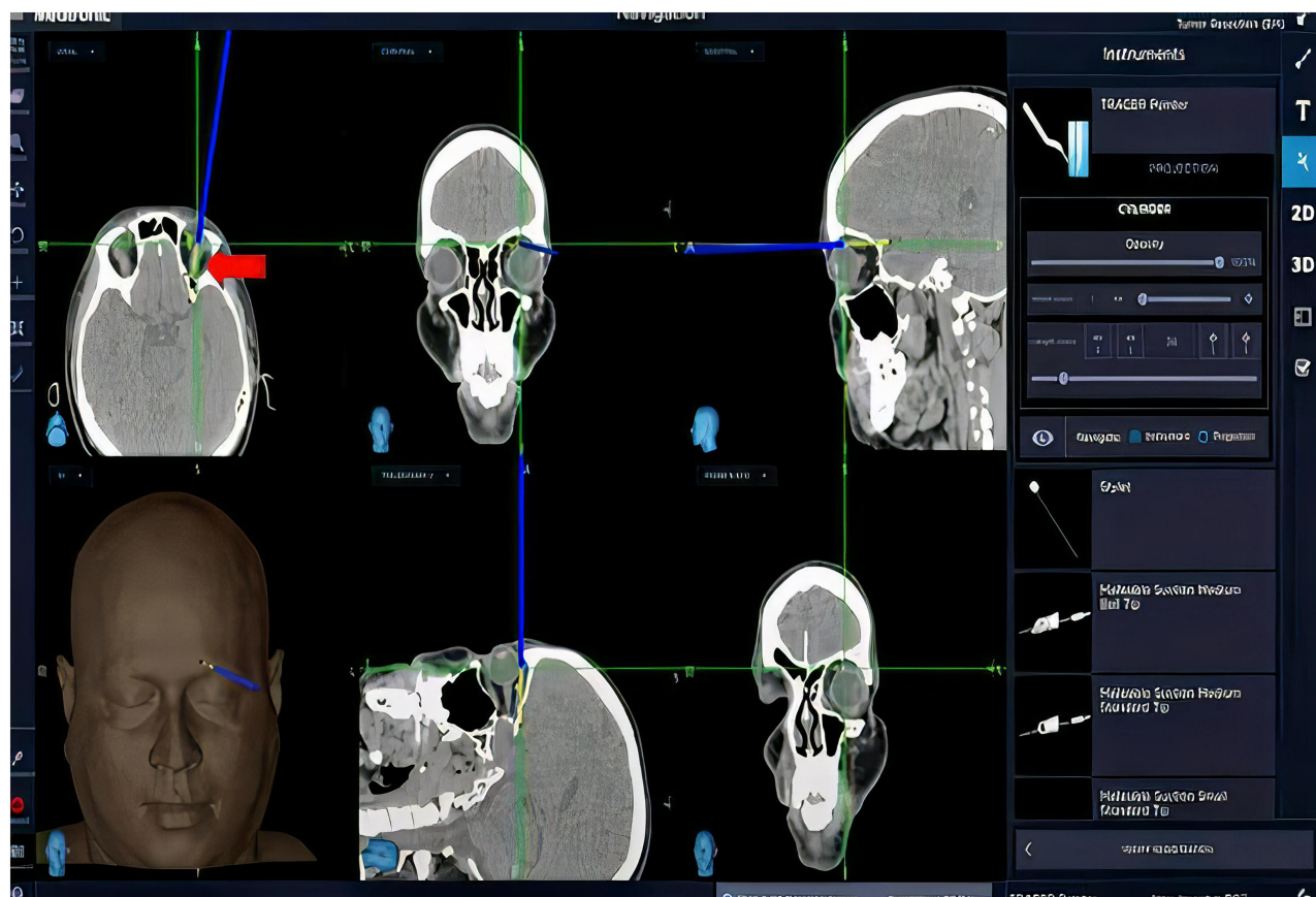
Figure 3 Intraoperative verification of points in axial, coronal and sagittal section. A red arrow indicate the supraorbital bony landmark verified by the confluence of line during point registration with a navigation probe.

on all three planes, which are generally shown by two lines coinciding with each other. Once this is verified, fixation and closure are then carried out subsequently.