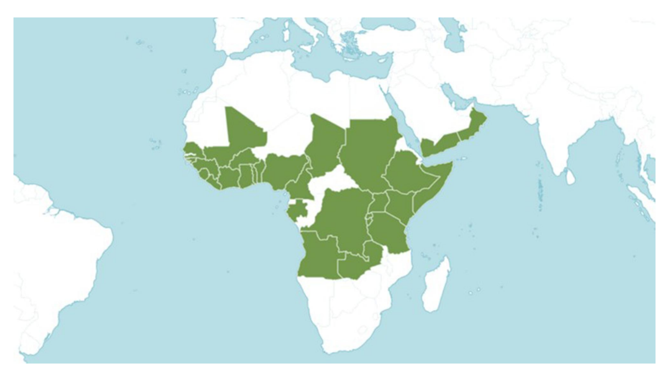
Figure 2 The geographical distribution of G. mollis in sub-sahara Africa and the middle east. The plant is native to the following countries in alphabetical order: Angola, Benin, Burkina, Burundi, Cameroon, Chad, Ethiopia, Gabon, Ghana, Guinea, Guinea-Bissau, Ivory Coast, Kenya, Liberia, Mali, Nigeria, Oman, Rwanda, Senegal, Sierra Leone, Somalia, Sudan, Tanzania, Togo, Uganda, Yemen, Zambia, Zaïre (The International Plant Names Index and World Checklist of Selected Plant Families 2020, www.ipni.org and www.apps.kew.org/wcsp/).

(WatF). The stock solution of the extracts and fractions were dissolved in dimethyl sulphoxide (DMSO) and the final concentration used for the assay was 10 mg/mL. A schematic representation of the extraction process is shown in Figure 3.