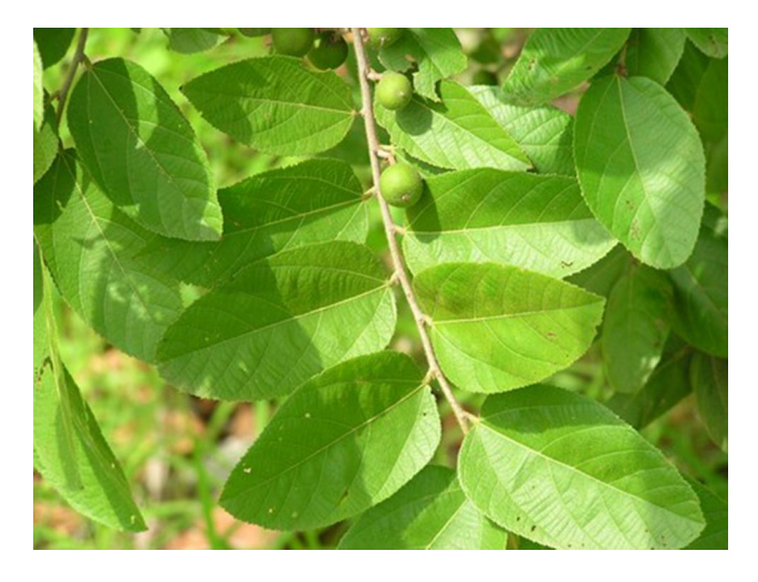
Figure I Grewia mollis plant growing in its natural habitat (Source: self).

Fresh leaves of G. mollis were collected in April 2015 from Babari village, Zaria, Nigeria. Plant verification was