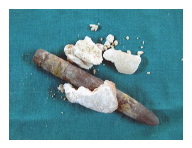
Figure 1 Case 1: Broken oxalate calculus which was encapsulating pen casing.

broken catheter was first fixed with sticking and then used to drain the patient's bladder.