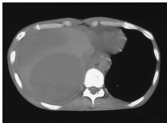
Figure 2 Computed tomography (CT) of the abdomen showing a large liver abscess.

a leukocyte count of 10,320/ \mu L with 89% neutrophils, 8% lymphocytes, 3% monocytes, hemoglobin 8.8 g/dL, C-reactive protein 23.6 mg/dL, aspartate aminotransferase 95 U/L, alanine aminotransferase 74 U/L, alkaline phosphatase 478 U/L, \gamma -glutamyl transpeptidase 134 U/L, albumin 2.1 g/dL, total cholesterol 57 mg/dL, blood urea nitrogen 18.4 mg/dL, creatine 0.57 mg/dL and hyponatremia (123 mEq/L). The findings of human immunodeficiency virus type 1 antibody tests were positive for enzyme immunoassays (EIA) and also based on the Western blot method. Thoracentesis revealed milk chocolate or café au lait colored pleural fluid (Figure 3). In an examination of the pleural fluid,