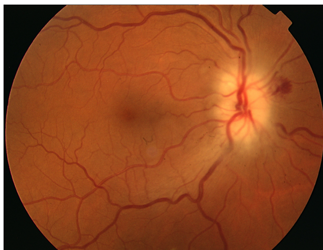
Figure 1 Swollen optic disc of the right eye with small hemorrhages.

The first day after the surgery, the patient was conscious but sleepy. On the second day, she complained of visual loss in her right eye (RE) and one day later in her left eye (LE). Best-corrected visual acuity (BCVA) was hand movement in the RE and 20/50 in her LE. The pupils were equal in size, but a relative afferent defect was found in the RE.