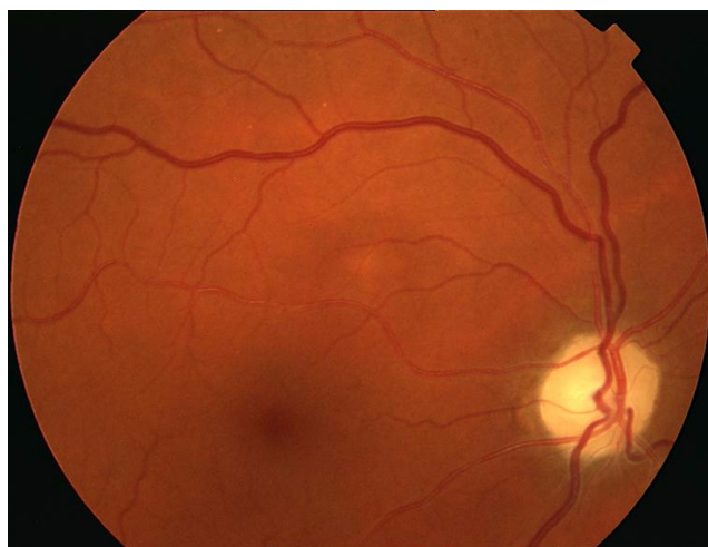
Figure 3 Optic nerve atrophy.

portion of the optic nerve. Blood flow in the orbit is relatively low compared with blood flow to the eye and other portions of the nerve; therefore, this portion of the nerve may be more vulnerable to ischemia due to hypoperfusion. 10