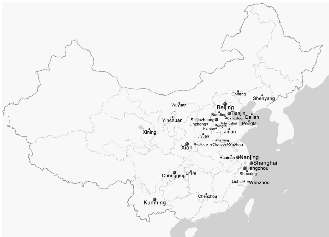
Figure 1 The geographical locations of participating hospitals in the ICONS.

Regarding the identification of PSCI, the best cut-off point was still be controversial. 13–16 The meta-analysis by Lees et al showed that the conventional cut-off point ( <26/30 ) had excellent sensitivity (0.95) but suboptimal specificity (0.45). By comparison, the adapted MoCA cut-off point ( <22/30 ) improved specificity (0.78) while maintaining good sensitivity (0.84). 15 Previous research by our team also found that MoCA cut-off score of 22/23 was optimally sensitive (0.85) and specific (0.88) for detecting CI after mild stroke and TIA in Chinese patients. 16 The overall patients enrolled in our study may be relatively mild. So in this study, we also define CI as \text{MoCA} \leq 22 .