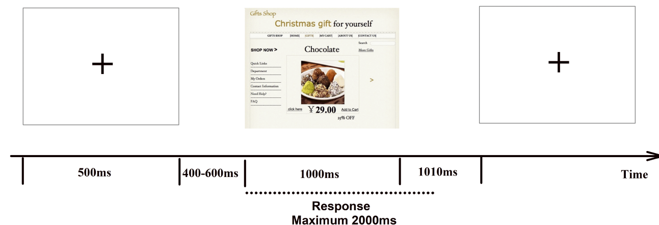
Figure 1 Experimental procedure. The subjects were presented with two types of webpage order [high order and low order]. They were instructed to report their purchase intentions. During the experiment, EEGs were simultaneously recorded.

During off-line processing, the EEG recordings were segmented for the epoch between -200 and 800 ms of stimulus onset. Baseline correction was conducted using the pre-stimulus of 200 ms as the baseline (i.e., subtracting the voltage measured during the pre-stimulus window). Ocular artifacts (such as eye blinks, eye movements)