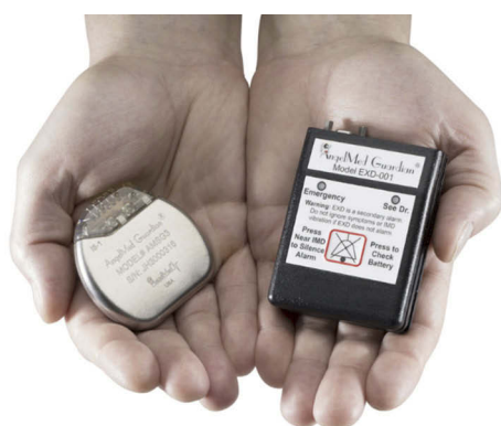
Figure 2 Implantable medical device (IMD) and external medical device (EXD).