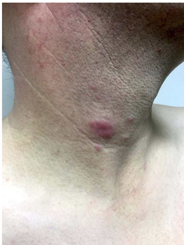
Figure 1 Clinical picture of Lupus erythematosus tumidus: erythematous, urticarial plaque and papules on the neck of a 43-year old male smoker. Consent was received for the publication of this image.