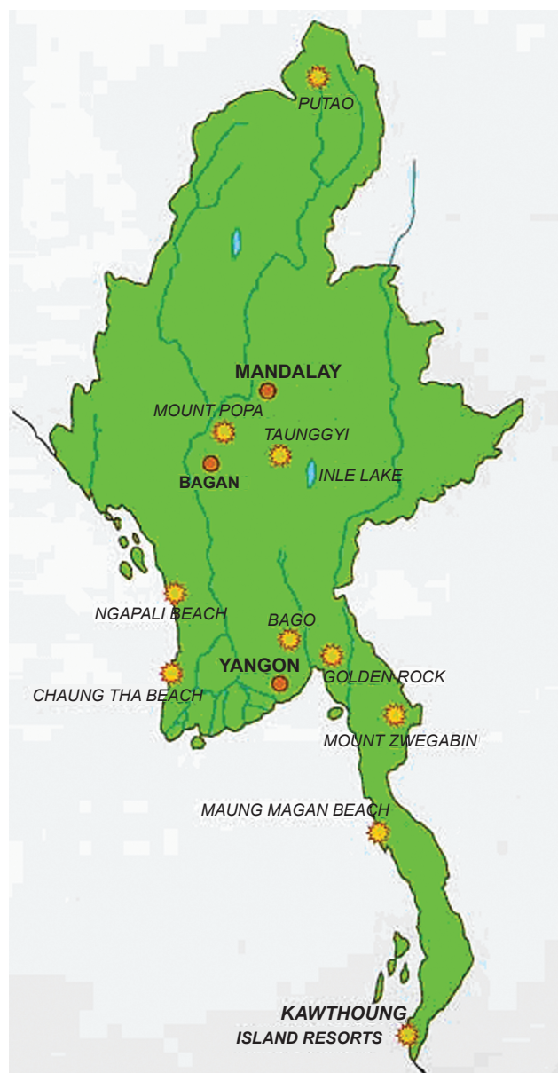
Figure 1 Mount Popa location in central Myanmar.

A medical record was compiled for all patients examined at Mount Popa Jivita Dhana Ahrawja Sangha Hospital over a period of three weeks in January–February 2006 by three ophthalmic surgeons. Six hundred fifty consecutive patients attending clinics were recruited and examined. All of them underwent general medical and ophthalmic interview. The patients came from throughout the district