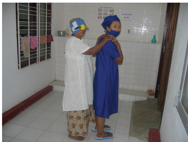
Figure 3 A patient with cataract is taken to theatre for cataract operation. Her right eye is prepared by retrobulbar anesthesia.

Corneal scarring accounted for visual loss in 78 patients (14.7%), and 10 of them were children (25%). Nineteen cases (24.3%) were congenital corneal pathology, and 59 (75.6%) were acquired. Of the acquired cases 23 (29.5%) were following trachoma (Figure 5), 14 (17.9%) followed trauma (Figure 6), 10 (12.8%) were post-corneal infections, six (7.7%) were associated with glaucoma, four (5.1%) were related to pterygium, and two (2.6%) were for unknown reasons.