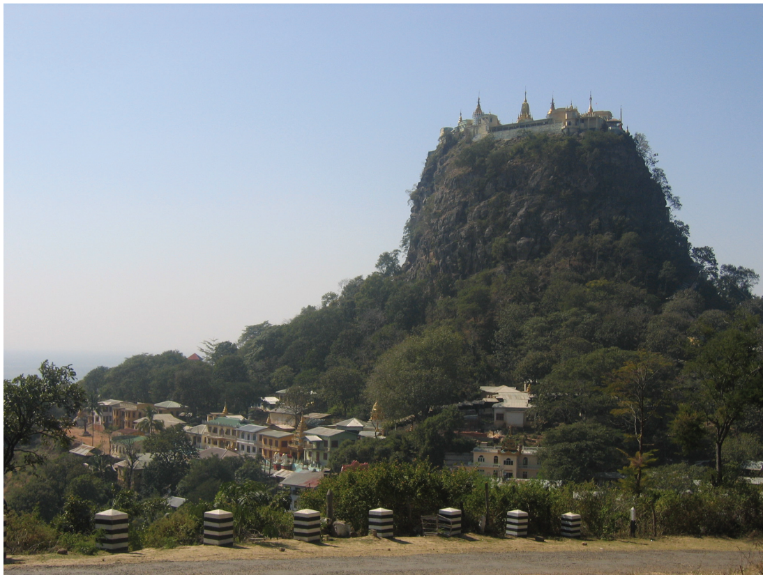
Figure 2 The summit of Mount Popa. The villages are at the bottom of the mount.

was assessed for ability to perceive light. Pinhole VA was assessed and those who improved were refracted. Anterior segment examination was performed by slit lamps. The pupils were dilated except where inappropriate (for example, phthisis bulbi, large central corneal opacity precluding view of the fundus, advanced cataract, narrow angle closure glaucoma suspected). An ophthalmologist determined the cause of visual impairment. The cause of visual loss was recorded using the anatomical and etiological classification in the form.