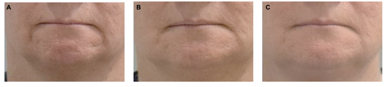
Figure 3 Scar correction with hyaluronic acid dermal filler. Notes: A 49-year-old patient with atrophic scars on the chin, before (A) and after the treatment at Week 4 (B) and Week 24 (C). A total of 4.4 mL of the filler was injected into the lower face: 3.4 mL on Day I and I mL 2 weeks later for a touch-up.

The effectiveness observed in patients with FLA was comparable to the effectiveness of other HA fillers, tested in patients with HIV-related lipoatrophy. The scales used across the studies were slightly different, but in general, the esthetic improvement rates at 6 months ranged from 90% to 100%. 9-11,13 The frequency of side effects in the current study was lower than stated in the literature. In the present study, treatment-related adverse events were reported in four patients with FLA (18%), compared to 29%–70% in other trials. 9-13 Although none of our patients had a history of HIV, a higher incidence of side effects was more likely related to subcutaneous administration of the filler, which was driven by characteristics of the filler used. The average amount of the