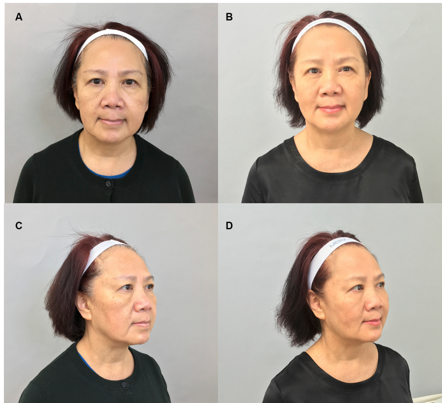
Figure 5 Treatment of the whole-face by RAD hyperdilution.

Notes: Patient is shown before ( A and C ) and 3 months after treatment ( B and D ).