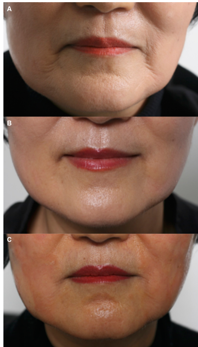
Figure 2 Treatment of marionette lines with diluted RAD using 27G cannula.

A 36-year-old female presented with thin, dry skin, decreased pan-facial skin elasticity anteriorly, and mid-face volume loss with consequent hollowed cheek and relative prominent zygoma and depressive temples (Figure 4A and C). Three milliliters of CaHA was mixed with 2% lidocaine in a 1:1 ratio (total injection volume of 6 cc) and injected with a 27G cannula into the subdermal layer of both cheeks. To treat a wide cheek area, up to 0.01 mL of filler per stroke was injected in a pattern of multiple passes to cover the whole cheek area. Following injection, volume restoration was immediately visible. At 5-months postinjection (Figure 4B and D), the patient's skin showed markedly improved skin tone, elasticity, and brightness (with less pigmentation). Morphological improvements included volume restoration of the hollowed cheek and camouflaging of prominent zygoma