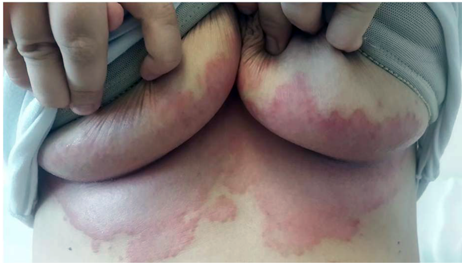
Figure 1 Candida intertrigo on the infra-mammary folds of a middle-aged woman.