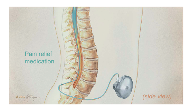
Figure I IT device with mechanical infusion pump and IT catheter. Note: Illustration © 2016 Jackie Meyer. Abbreviation: IT, intrathecal.

An IT drug delivery device comprised pump reservoir, mechanical infusion pump, and IT catheter (Figure 1).<sup>27</sup>