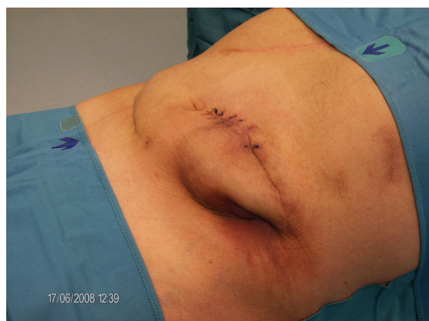
Figure 2 Subcutaneous tissue necrosis at the caudal edge of an implanted SynchroMed II pump. Skin sutures after an attempt to correct the pump placement by moving the device more medially are still visible.

Despite innovations such as electronic, programmable pumps with the potential for patient-controlled bolus application, as well as new drugs, the shortcomings in available therapy remain considerable. These shortcomings are reflected in complications related to intrathecal therapy such as catheter disconnections, spinal fluid leakage, tissue necrosis, battery exhaustion, misses of refill ports with resulting paravasates, drug incompatibilities, catheter granulomas, and seromas around the implants. These complications suggest many possibilities to further optimize intrathecal pain therapy: improving catheter connections to withstand average physical stress; designing catheters that avoid spinal fluid leakage