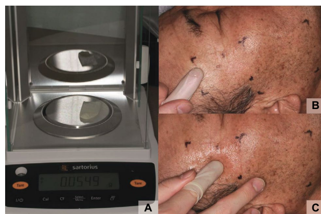
Figure 1 An example of application: after measuring the area of application site, the amount of ingenol mebutate (IM) to be applied is measured using a precision balance (A). The amount of IM is then equally spread to the affected area with a gloved finger (B and C).

Therapeutic outcomes were clinically evaluated 2 months after the initial IM application by using photographs and medical records. The following variables were included in the analysis: completion of three consecutive applications; composite LSR score; pain score; clearance rate of AK lesions. Each patient's clearance rate was calculated as: (the number of AK decreased after treatment/the number of AK before treatment) × 100 (%). Partial clearance was defined as