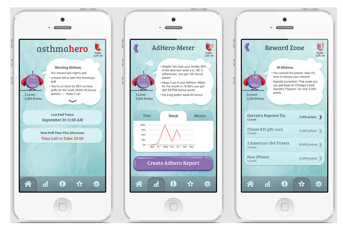
Figure 2 Mobile iPhone app.