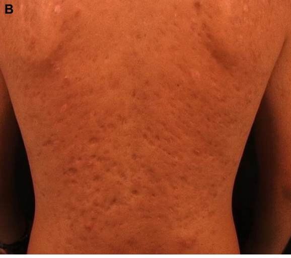
Figure 5 Severe atrophic acne scars on the back of a young man before (A) and 6 months after one ablative fractionated carbon dioxide ( CO_2 ) laser treatment (B).

occur. Patients often encounter posttreatment erythema and edema following nonablative fractional resurfacing that typically resolve within 3 days. 176 Erythema that extends beyond 4 days is considered prolonged and is reported in <1% of patients. In contrast, erythema that lasts beyond 1 month following ablative fractional laser treatment is considered prolonged and is seen in ~12.5% of patients. 177 A 590 nm light-emitting diode system has been shown to reduce postfractional laser erythema.<sup>178</sup> Herpes simplex virus infection is the most common infectious complication following fractionated laser treatment, affecting up to 2% of patients.<sup>177</sup> It is generally recommended to treat patients prophylactically if they have a history of facial herpes simplex virus or if perioral laser treatment is performed. Bacterial infection is comparatively low with an incidence of 0.1%. 177 Antibacterial prophylaxis can be useful prior to ablative fractionated laser resurfacing. In addition, transient acneiform eruptions can