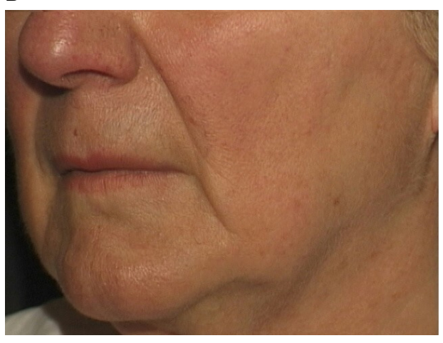
Figure 1 Facial erythema and prominent telangiectasias in a patient with rosacea before ( \bf A ) and after two 595 nm pulsed dye laser (PDL) treatments ( \bf B ).

effective for leg veins and is considered the gold standard treatment; however, it can be associated with significant adverse effects such as ulceration, allergic reactions, and telangiectatic matting. <sup>53,54</sup> The KTP and PDL lasers as well as IPL have shown efficacy in the treatment of small vessels measuring <1 mm. <sup>55–57</sup> The treatment of larger and/or deeper vessels requires longer wavelengths and pulse durations. The LP alexandrite (755 nm), diode (800 nm), and Nd:YAG (1,064 nm) lasers have each been successful in eradicating small- to medium-sized veins. <sup>57–59</sup>