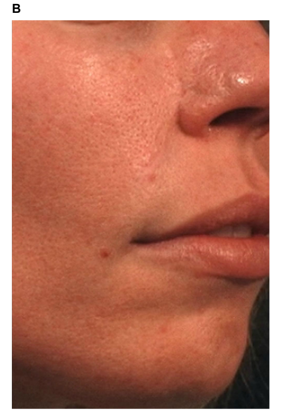
Figure 2 Hypertrophic and erythematous surgical scar before (A) and after two pulsed dye laser (PDL) treatments (B).

Note: Reprinted from Facial Plast Surg Clin North Am , 2011;19(3), Sobanko JF, Alster TS, Laser treatment for improvement and minimization of facial scars, 527–542,61 Copyright © 2011, with permission from Elsevier.