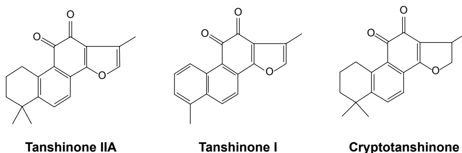
Figure 1 Chemical structures of major tanshinones.