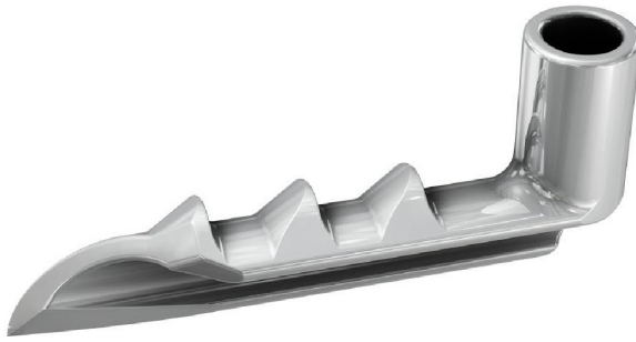
Figure 1 The iStent.

iStent comes preloaded in a customized single-use stainless steel inserter used to guide and release the stent directly into Schlemm's canal. The inserter features a release button activated by the surgeon to release the stent from the inserter.