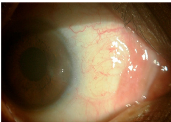
Figure 3 The graft at the end of 3 months.

All patients were followed-up for a minimum period of 6 months. On all postoperative visits, slit-lamp photography (Figure 3; UCVA, best-corrected visual acuity [BCVA]), astigmatism, and complications were recorded and subjective questionnaire regarding patient comfort was taken from all patients.