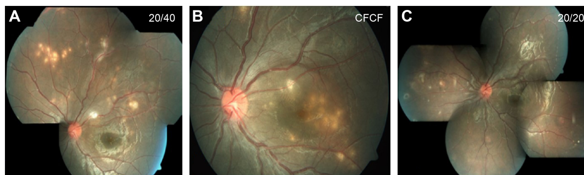
Figure 1 Fundus pictures of the left eye of an 11-year-old child who presented with blurred vision.

Notes: (A) At presentation, multiple subretinal yellow–white lesions were seen superiorly and at the superotemporal periphery and treated with antitubercular drugs and oral steroids (tapered over 2 months). (B) 1 month after stopping oral steroids, recurrent crops of multiple yellow–white subretinal lesions appeared at macula, which were treated with laser photocoagulation to the inferior retina and high-dose oral albendazole therapy. (C) Complete resolution of lesions was observed at 2 months. The child remains recurrence free 2 years after treatment.