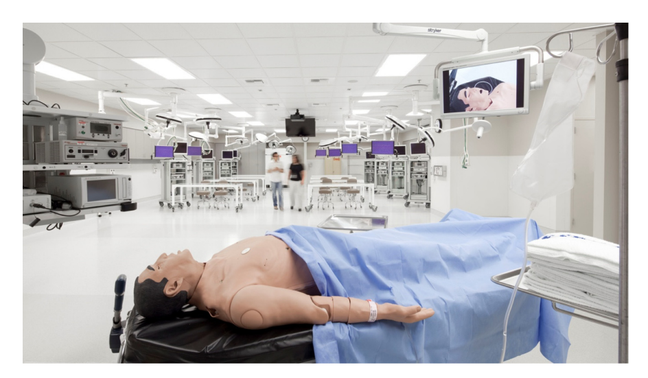
Figure 5 High fidelity mannequin in a state-of-the-art simulation facility.

developing brain.<sup>68–70</sup> Initial research demonstrated harm to the brains of young animals.<sup>71–74</sup> This raised concern that young children might also be at risk when exposed to anesthetic agents.<sup>75</sup> Following the publication of these concerning findings, human studies were initiated.<sup>76–79</sup> The results have often revealed conflicting conclusions, with some showing long-term deficits in learning and behavior while others have not.<sup>80</sup> This is a difficult area of study, because children who receive sedation and anesthesia commonly have pathologic conditions for which they require surgery. They may therefore be fundamentally distinct from their healthy peers. Adverse neurologic outcomes are also difficult to recognize