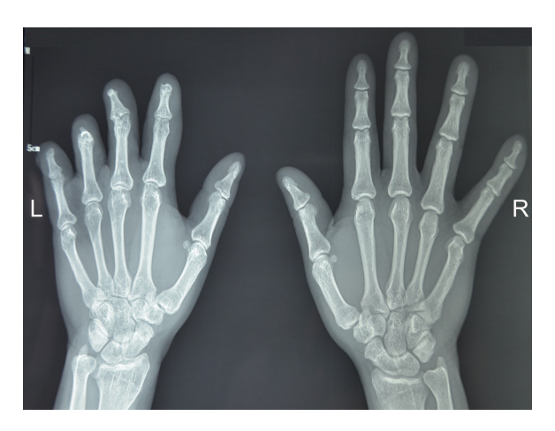
Figure 2 Male patient, 21 years old, with degloving damage involving four digits caused by machine-related trauma.

Reconstruction of the DIMF area requires large amounts of tissue, and regaining flexor function is challenging. Previous studies have explored using abdominal flaps, and Nazerani et al used this flap in six DIMF cases. 11 Yu et al 12 reported using an anterolateral thigh free flap to treat degloving injury involving three digits in one case, and Ju et al 8 used a combined dorsal great toe flap and dorsalis pedis artery flap to treat degloving injury of the thumb, with satisfactory results. Wang et al 13 used a cross-finger flap and a composite-free flap from the dorsum of the second toe to treat 18 cases of distal degloving