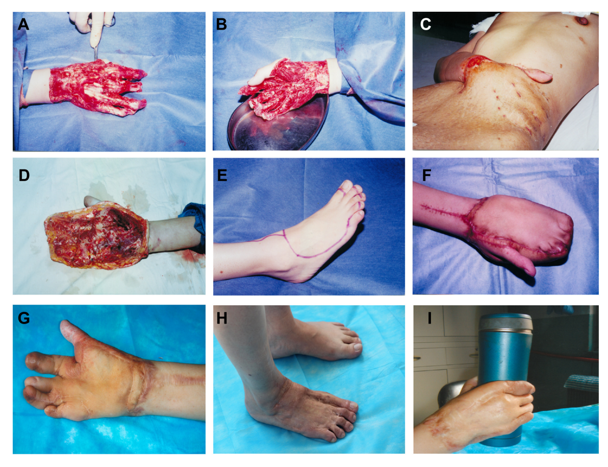
Figure 3 Female patient, 34 years old, with degloving damage involving all of the digits except the thumb. Notes: (A) Palm after debridement; (B) hand back after debridement; (C) embedding of the abdominal skin flap; (D) lateral side of the palm after the abdominal flap was removed; (E) design of the dorsalis pedis skin-flap removal; (F) preliminary healing of the foot flaps; (G) appearance during the final follow-up; (H) function during the final follow-up; (I) healing of the donor area.

reached an MRC level of S3–4, whereas functional recovery of the abdominal skin flap on the hand back only reached S0–1, confirming that coverage of the palm by the dorsalis pedis flap maximized hand-function recovery.