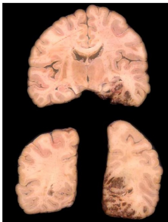
Figure 1 Pathological specimen showing a hemorrhagic cerebral infarction of cardioembolic origin in the vascular superficial distribution territory of the posterior cerebral artery.

Salient clinical manifestations of CI (Table 1) include sudden onset of neurological deficit, maximum focal neurological dysfunction at the onset of clinical symptoms, stroke onset while awake, speech disturbances, and the presence of a non-lacunar clinical syndrome. 24 Early differential diagnosis of CI should be mainly established with atherothrombotic infarctions, and sometimes, this differential diagnosis can be difficult on the basis of clinical symptoms alone. 20 However, in a comparative clinical study, it was found that sudden onset of neurological deficit and heart rhythm disturbance were independent predictive variables of cardioembolism, whereas hypertension, diabetes, dyslipidemia, and chronic obstructive pulmonary disease (COPD) were significantly related to atherothrombotic infarction. 20 Also, atrial fibrillation, heart valve disease, and ischemic heart disease are characteristic cardiovascular risk factors for CI, in contrast